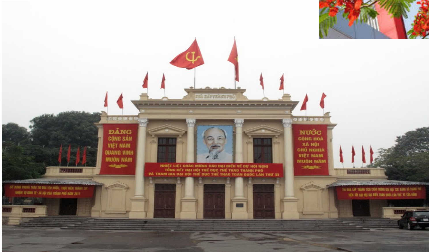
The City hall