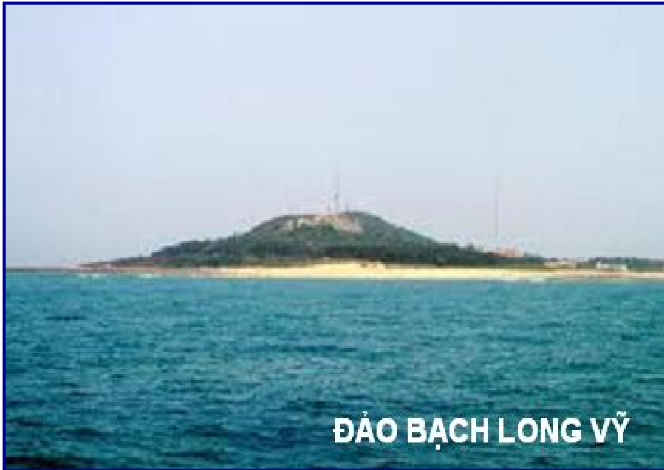
ĐẢO BẠCH LONG VỸ